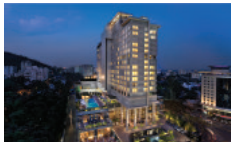
[Top to bottom] Paasha restaurant, dining in the hotel, outdoor area and the exterior of the hotel

meeting rooms have been designed scientifically for video reproduction for each of the meeting room. InfoComm standards have been followed in selection of the proper screen size and projector.”